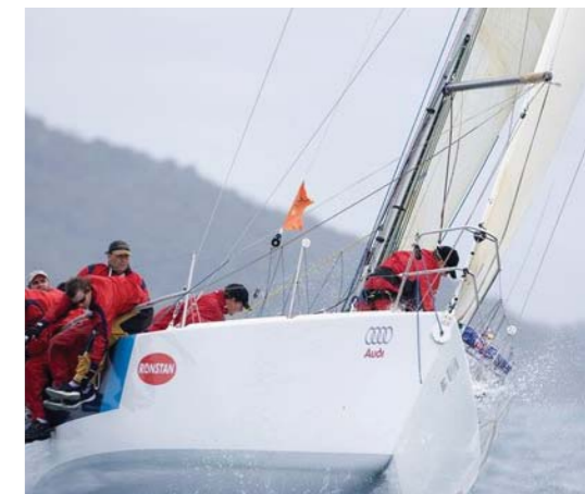
"Alegria" entrant in the 2008 Brisbane to Gladstone Yacht Race. Photo by Andrea Francolini © Photo.

The race is an Australian sporting icon being Queensland's premier blue water classic. It is